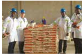
© FAO / Charles Mawungwa (Zimbabwe)