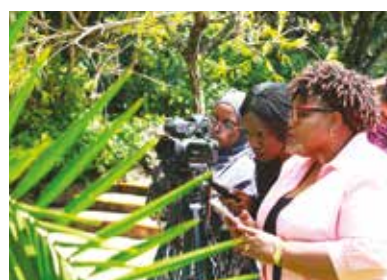
© FAO / Fredrick Onyango (Kenya)