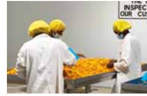
(Malawi)